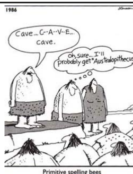
Primitive spelling bees

2nd Sundays In Jan., Feb., Mar. 12:00 Start